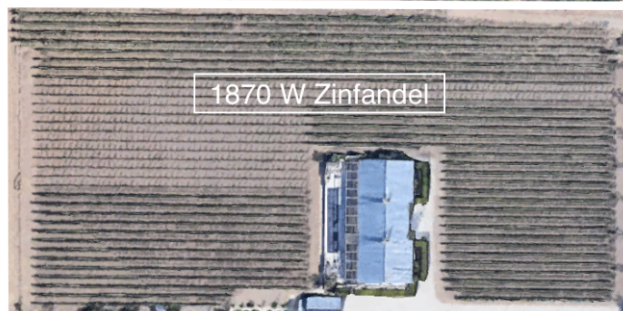
1870 W Zinfandel