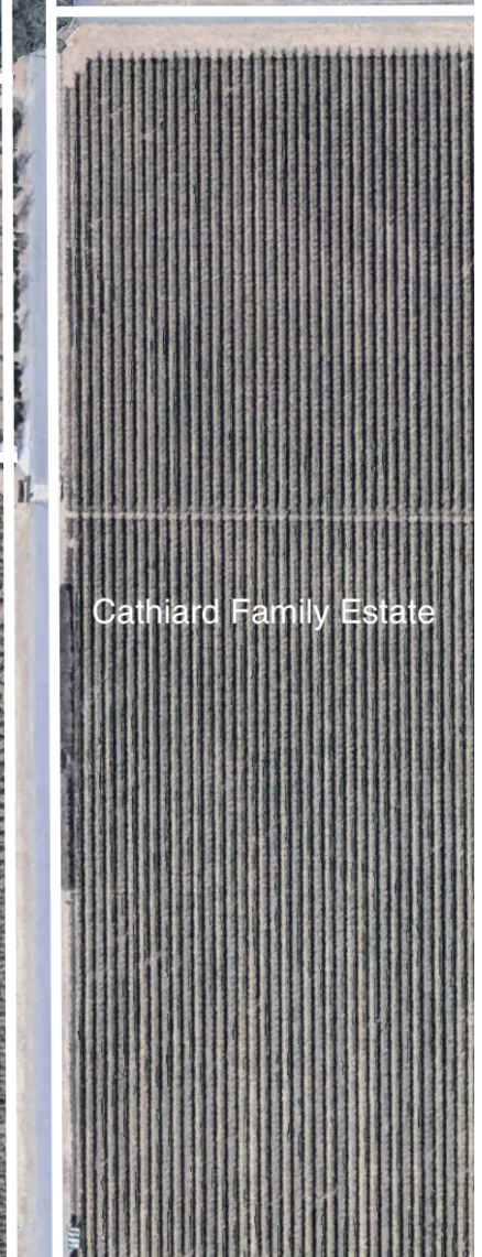
Cathiard Family Estate