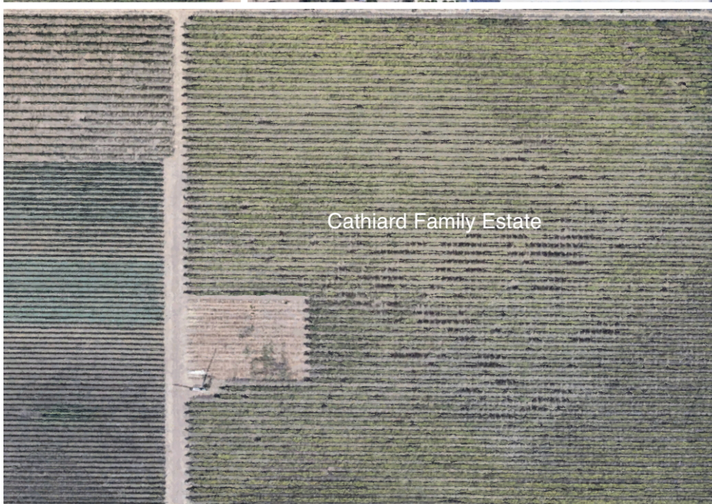
Cathiard Family Estate