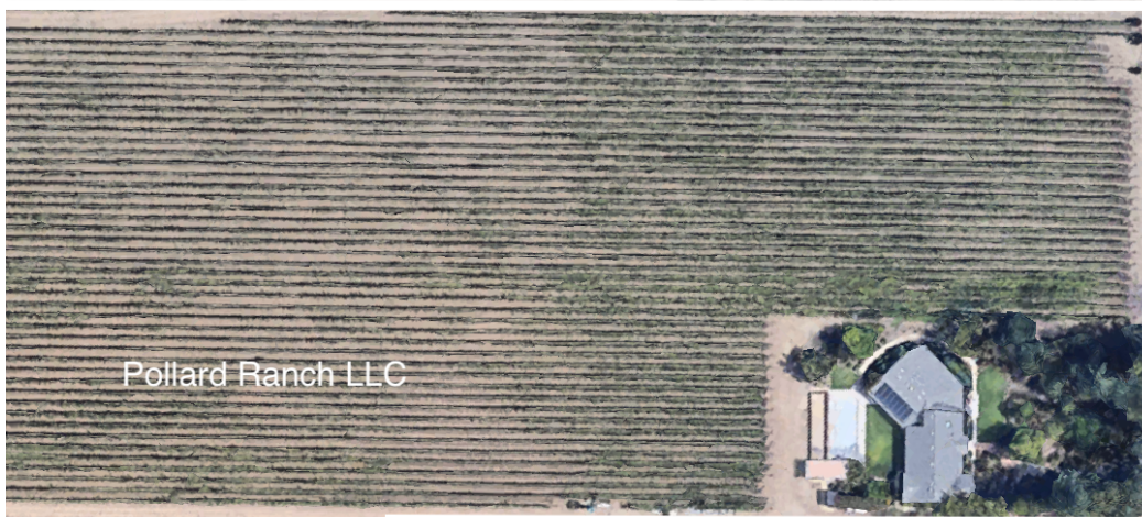
Pollard Ranch LLC